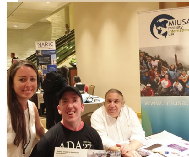
Sharing NCDE information at the National Council on Independent Living annual conference in 2017