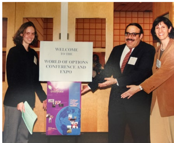
With MIUSA colleagues at the NCDE's World of Options Conference and Expo in 2000